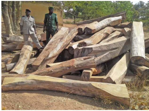
Timber seized in Burkina Faso.

The International Consortium on Combating Wildlife Crime 'ICCWC' is the collaborative effort of five intergovernmental organizations working to bring coordinated support to national wildlife law enforcement agencies and the sub-regional and regional enforcement networks that act in defence of natural resources.