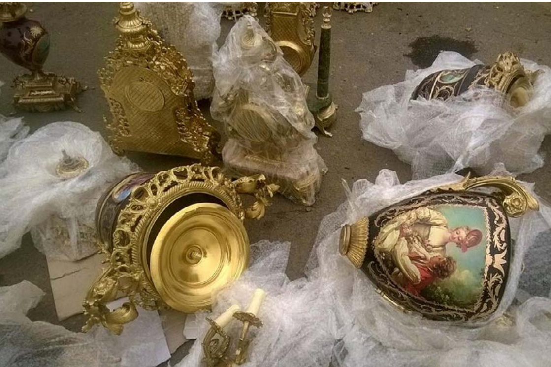
Porcelain artefacts from the Muhammad Ali Dynasty recovered during INTERPOL's "Monitor Eye" operation in Egypt in 2015.

Individuals or/and groups involved in the intentional destruction of cultural heritage, including looting, should be duly prosecuted.