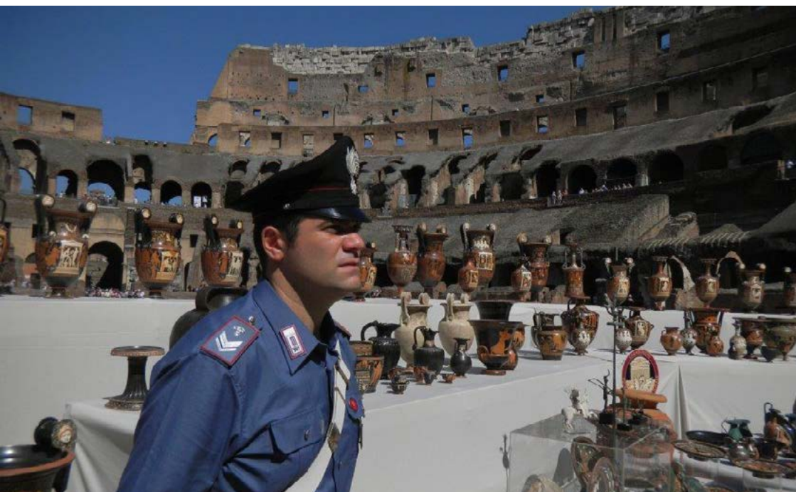
Press Conference held in 2010 at the Colosseum (Rome) by the Italian Carabinieri. Presentation of 337 antiquities recovered in Geneva (Switzerland) during the "Andromeda" operation.

To ensure the protection of cultural heritage, Italy, Jordan, INTERPOL, UNESCO, and UNODC have drawn up a list of suggested key actions. These are based on the outcomes of these meetings, the comprehensive guidelines adopted to support the implementation of the 1970 UNESCO Convention and the UN Convention on Transnational Organized Crime, and the priorities of experts working in the field.